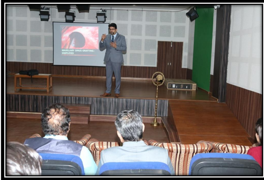
An effective lecture on the Sinus Lift Techniques

Budhera, Gurugram-Badli Road, Gurugram (Haryana) – 122505 Ph. : 0124-2278183, 2278184, 2278185