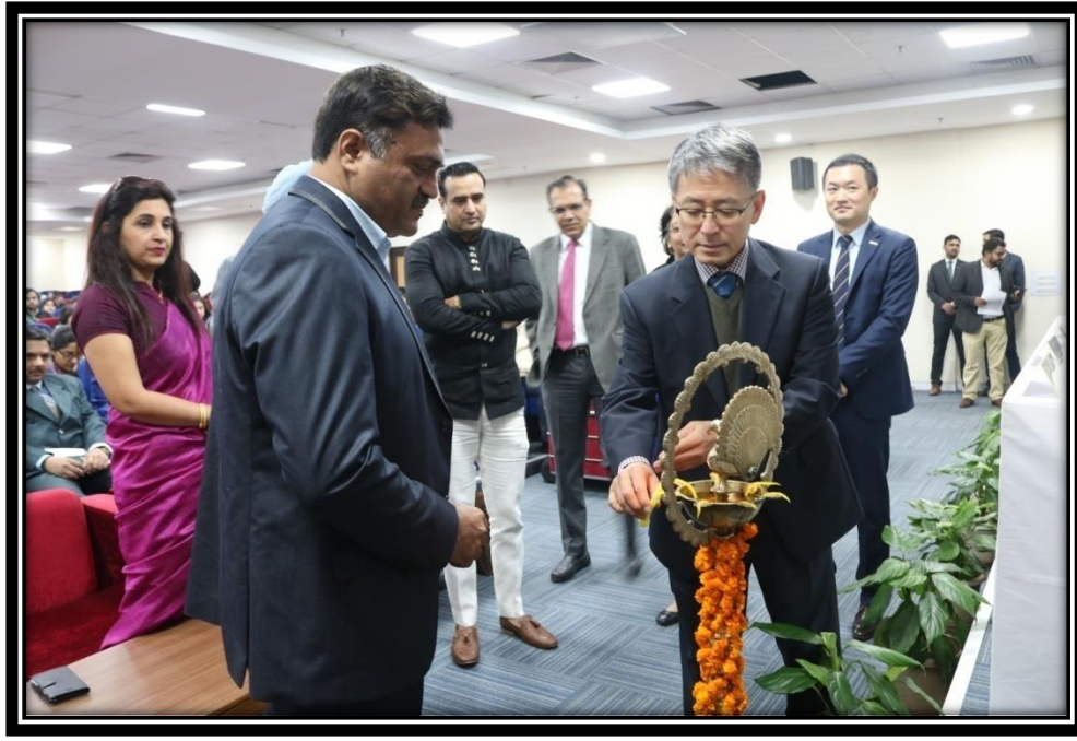
Lightning of the ceremonial lamp with Maa Saraswati's blessings by the Dignitaries

From an operator stand point, every surgical technique comes with a learning curve, and this CDE cum Workshop was indeed a great learning experience by the expertise with more than 75 delegates successfully completing the hands on course.