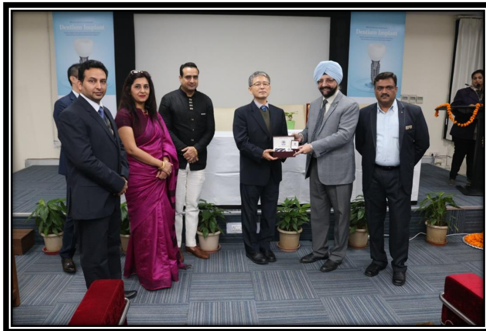
Welcome of Dignitaries by Presentation of Mementos and Gifts