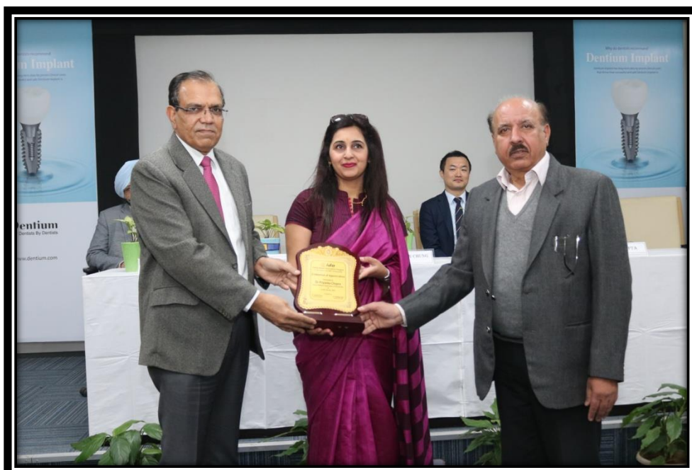
Presentation of Mementos by IDA-Gurugram Branch Members to the Organising Chairperson