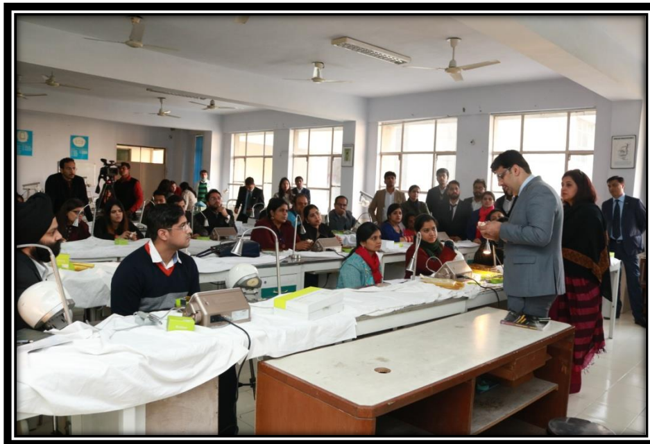
A Full fledged Hands-on session on Sinus Lift Latest Technique