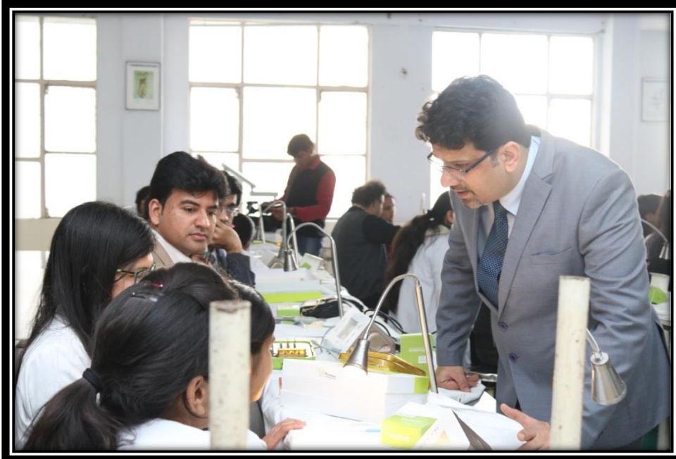
Enthusiastic Delegates during the Hands-On Session

Budhera, Gurugram-Badli Road, Gurugram (Haryana) – 122505 Ph. : 0124-2278183, 2278184, 2278185