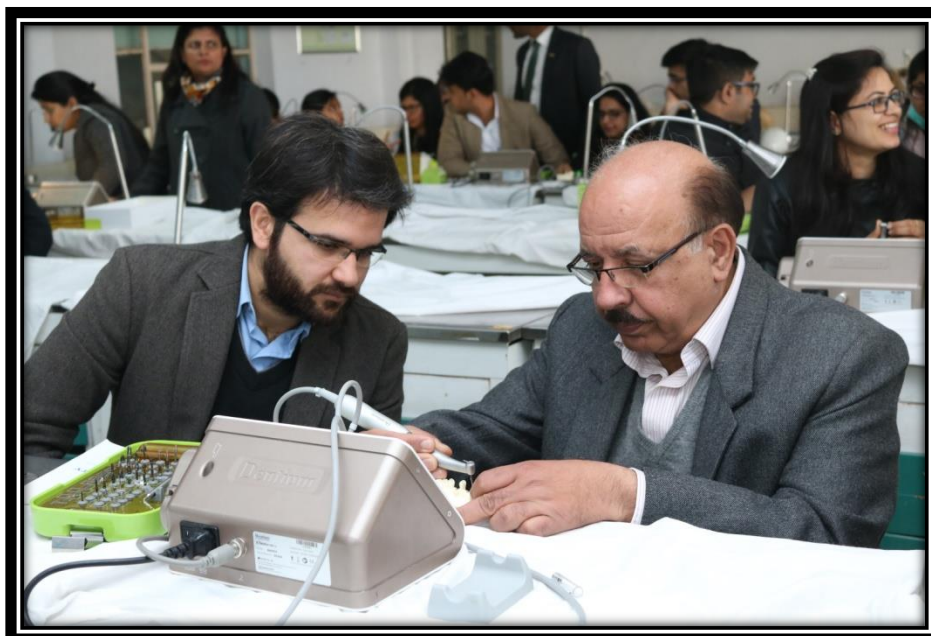
Enthusiastic Delegates during the Hands-On Session